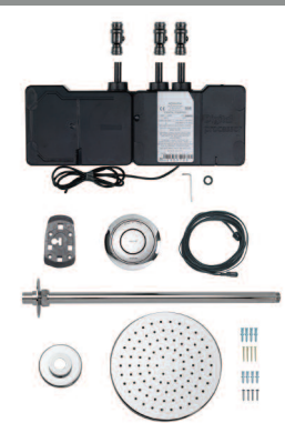
Literature not shown.