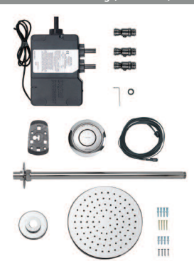
Literature not shown.