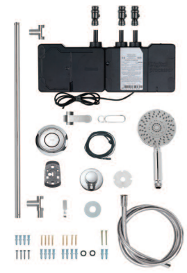
Literature not shown.