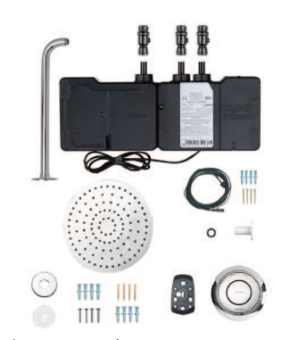
Literature not shown.