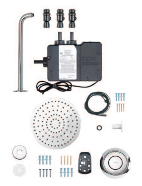
Literature not shown.