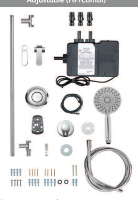
Literature not shown.