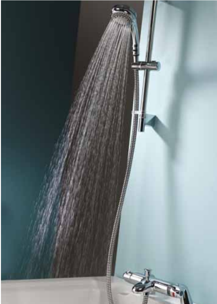
Midas 100 exposed bath shower mixer – bath mounted