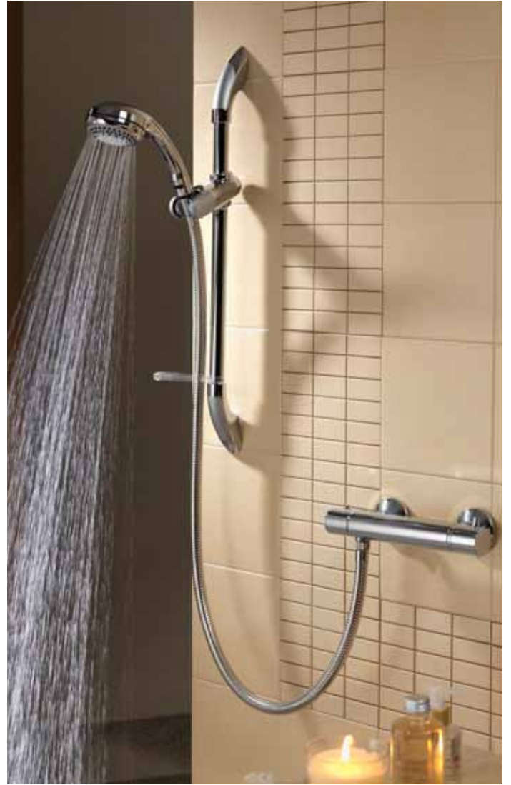
Midas 200 exposed shower