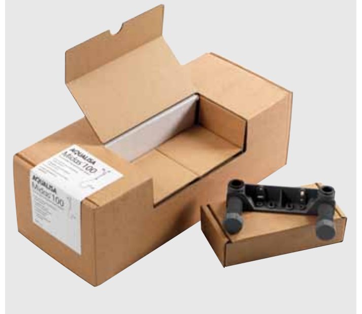
1st fix, 2nd fix packaging for Midas 100 MD100EBAR

Once the easy fit fixing bracket is installed, the installer can return to the job at a later stage, secure in the knowledge that the shower valve and kit are still safely sealed in the box. (See page 8 for details).