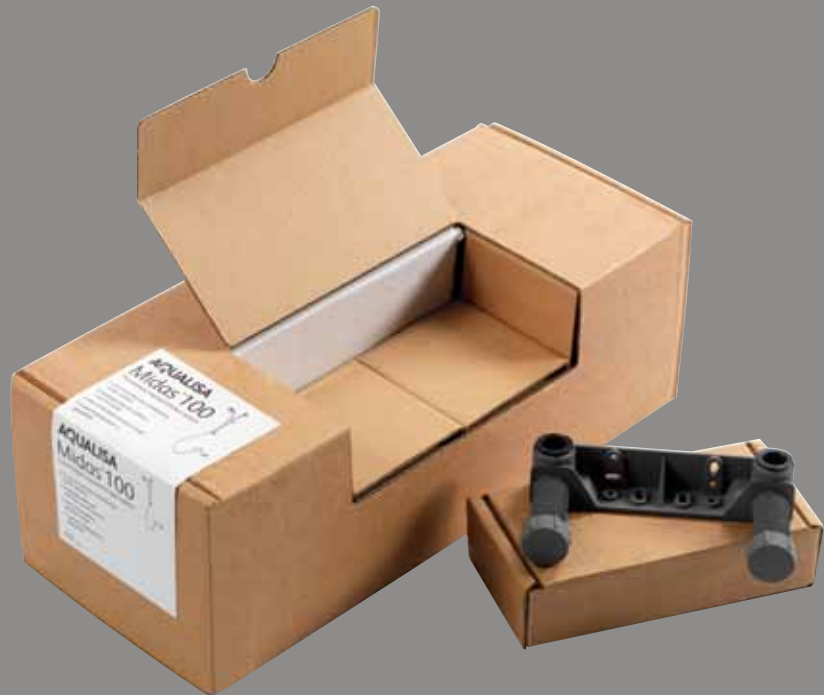
2nd fix box contains Midas 100 shower system

Designed with the installer in mind, this award winning packaging system for Midas 100 means the installer can access the easy fit bracket, fix it, and return later to finish the job – secure in the knowledge that the shower system is still sealed in the box.