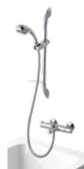
MD200BSM PLUS 525301