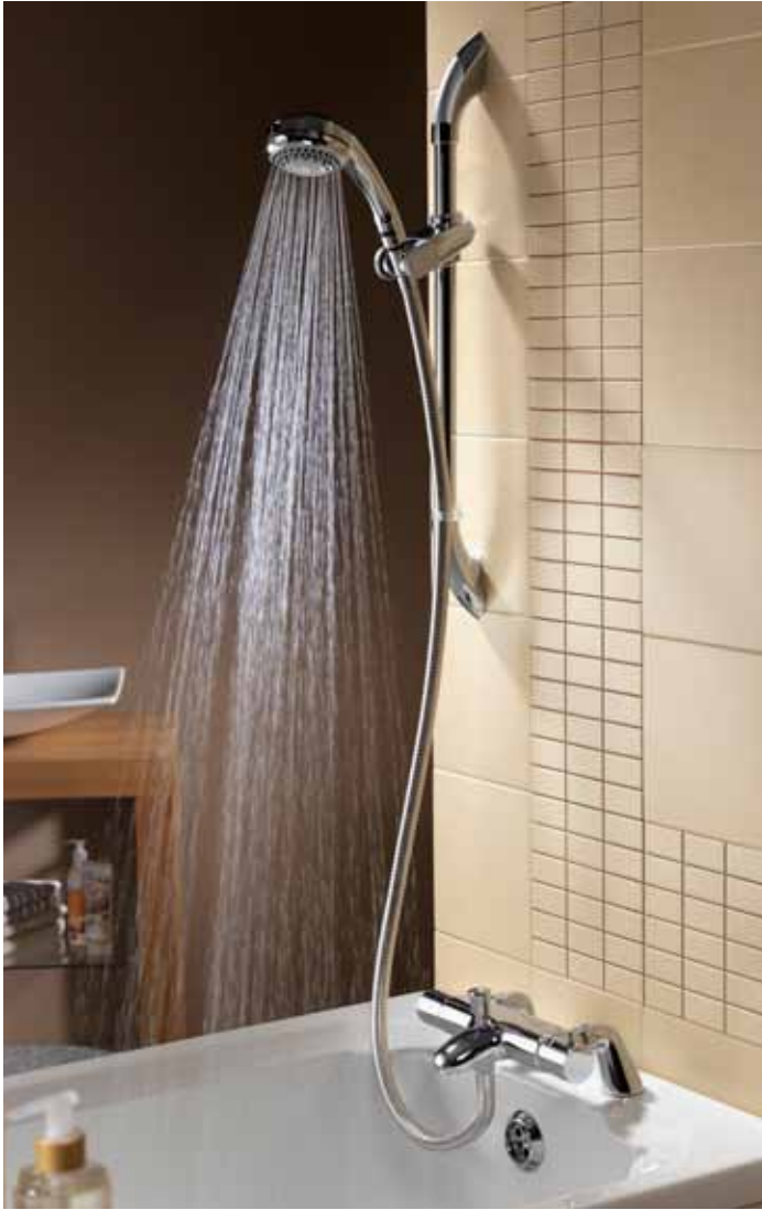
Midas 200 exposed bath shower mixer – bath mounted