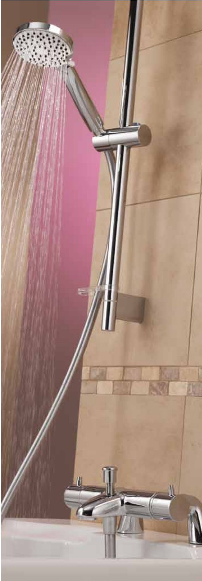
Midas 300 exposed bath shower mixer – bath mounted