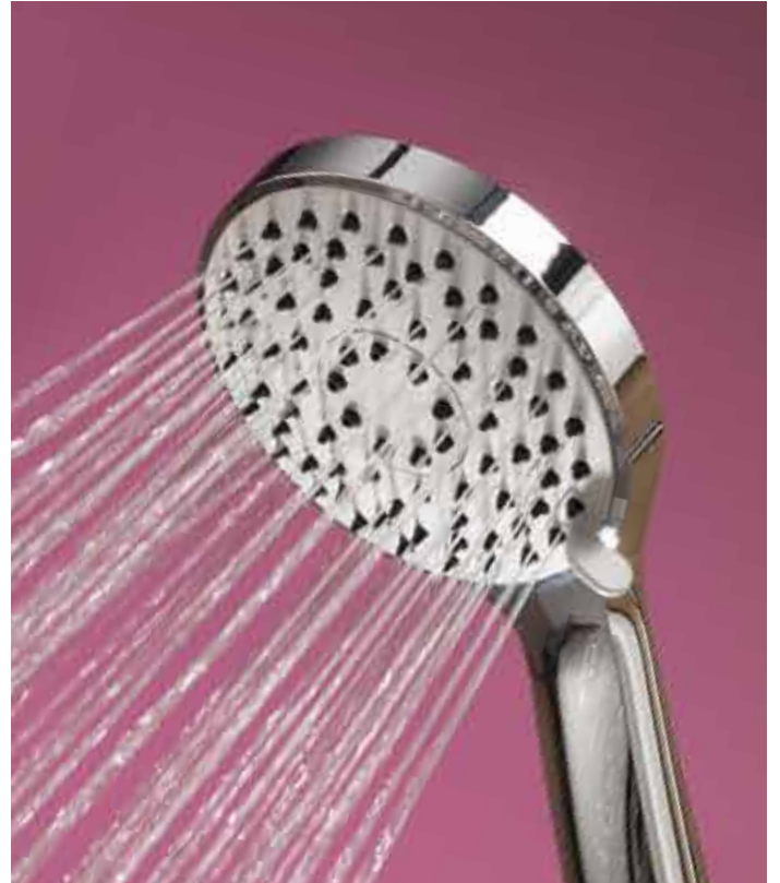
Midas 300 shower head with clickable control, and 3 well defined spray patterns