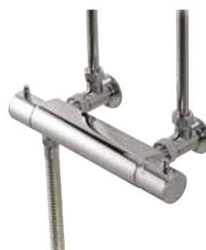
479106 (CHROME FITTINGS ONLY)