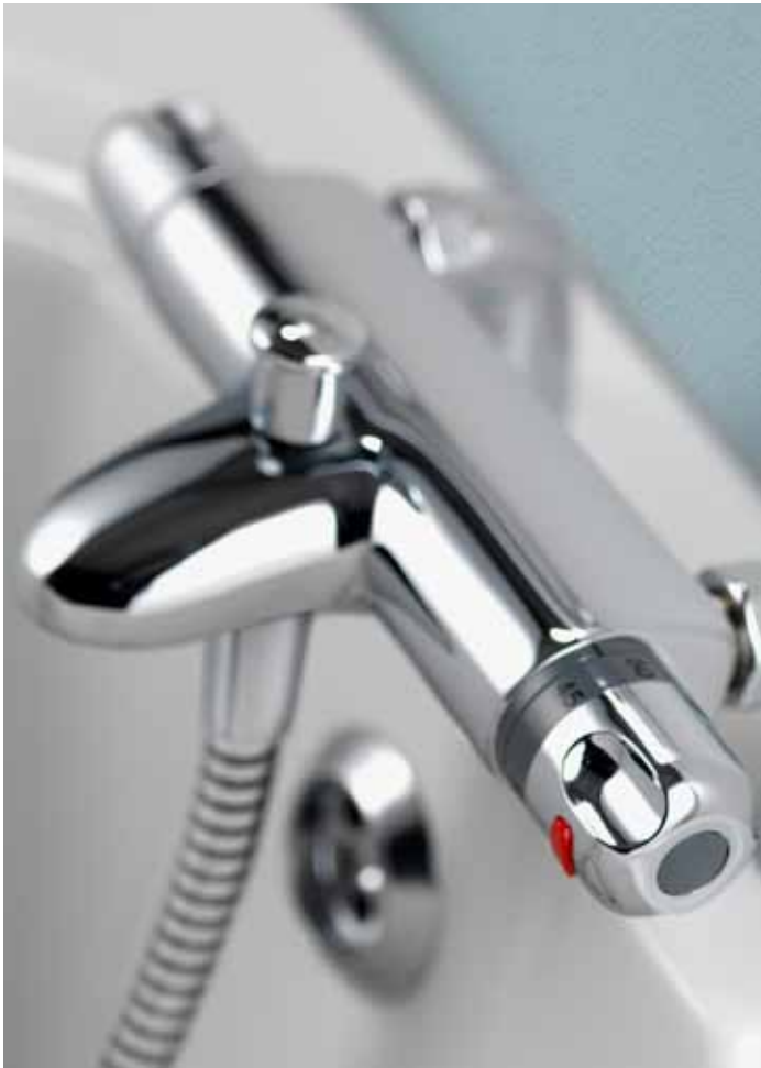
Midas 100 exposed bath shower mixer – bath mounted