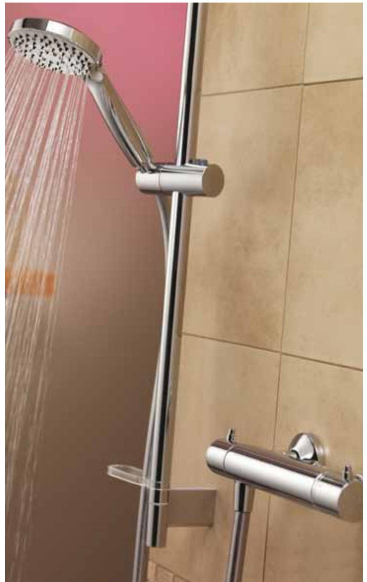
Midas 300 exposed shower