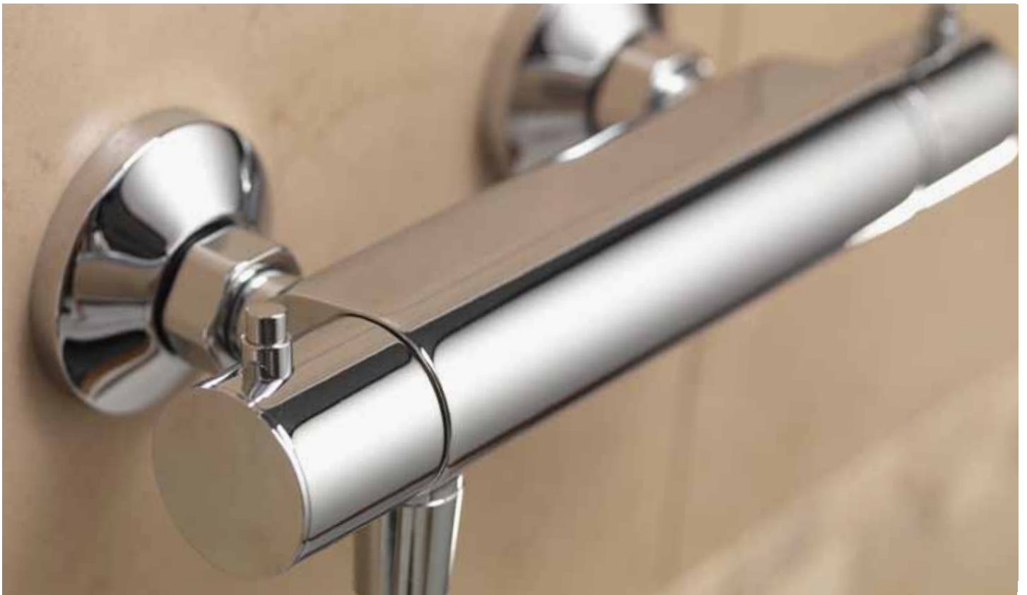
Midas 200 exposed shower valve