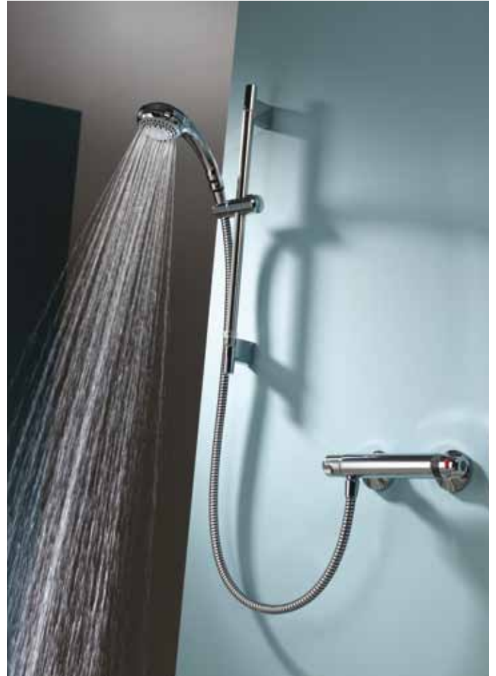
Midas 100 exposed shower