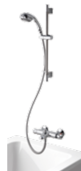
MD100BSM PLUS 525301