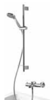
MD300BSM PLUS 525301