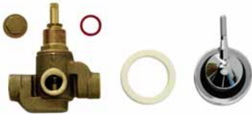
Literature not shown